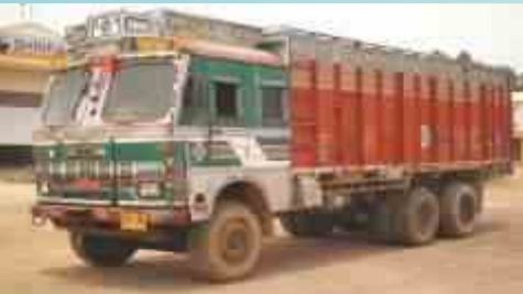
TATA LPT 2515 CARGO TRUCK