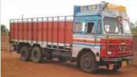
TATA LPT 2515 CARGO TRUCK