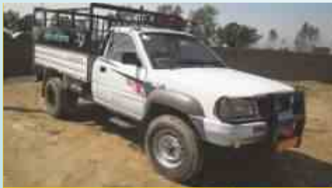
TATA 207 DI PICK UP