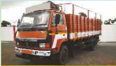
TATA LPT 1109 CARGO TRUCK