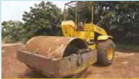
L&T CASE 1107D SOIL COMPACTOR