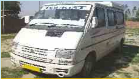
TATA WINGER MINI BUS