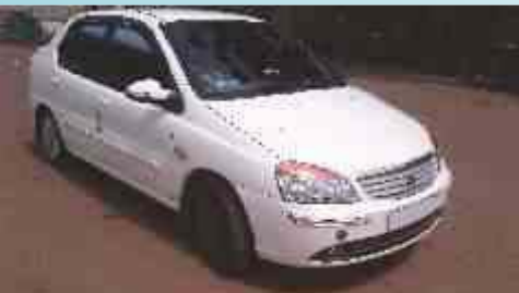
TATA INDIGO AUTOMOBILE