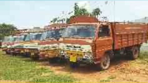
SWARAJ MAZDA CARGO TRUCKS