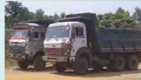
TATA 2516 TIPPERS