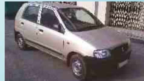
MARUTI ALTO AUTOMOBILE