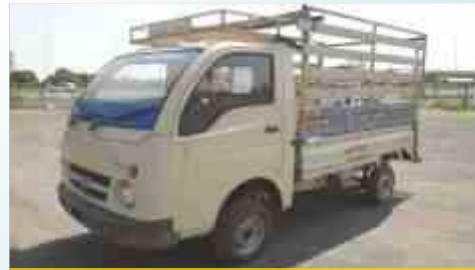
TATA ACE PICK UP