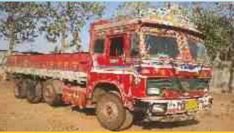
TATA LPT 3118 CARGO TRUCK