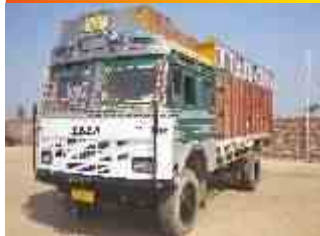
TATA LPT 1613 CARGO TRUCK