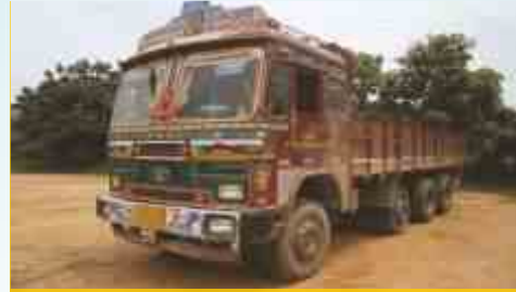
TATA LPT 3118 CARGO TRUCK