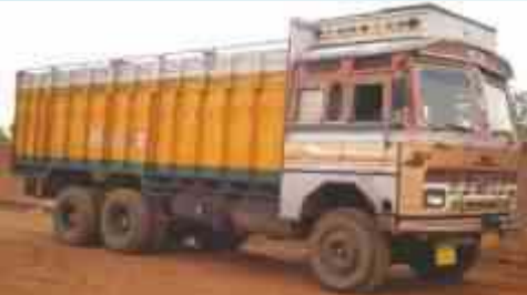
TATA LPT 2515 CARGO TRUCK