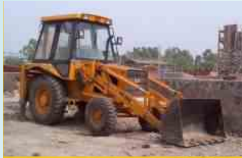
ACE AX 130 LOADER BACKHOE