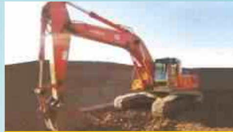
TATA HITACHI ZAXIS 330 HYDRAULIC EXCAVATOR