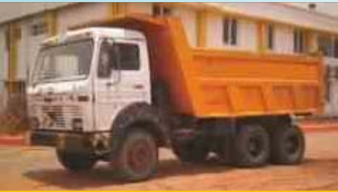
TATA 2516 TIPPER