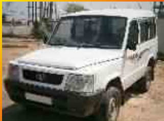
TATA SUMO MULTI UTILITY