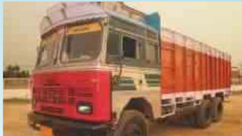
TATA LPT 2515 CARGO TRUCK