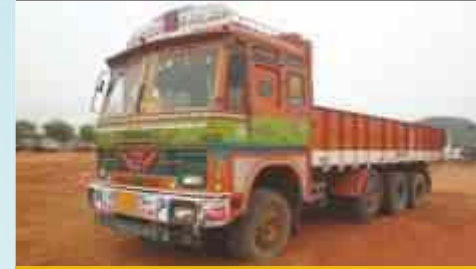
TATA LPT 3118 CARGO TRUCK