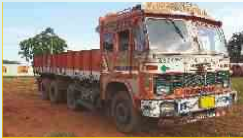
TATA LPT 3118 CARGO TRUCK