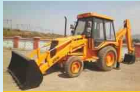
JCB 3D LOADER BACKHOE