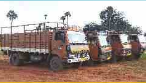
TATA LPT 1109 CARGO TRUCKS