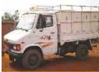
TATA SFC 407 CARGO TRUCK