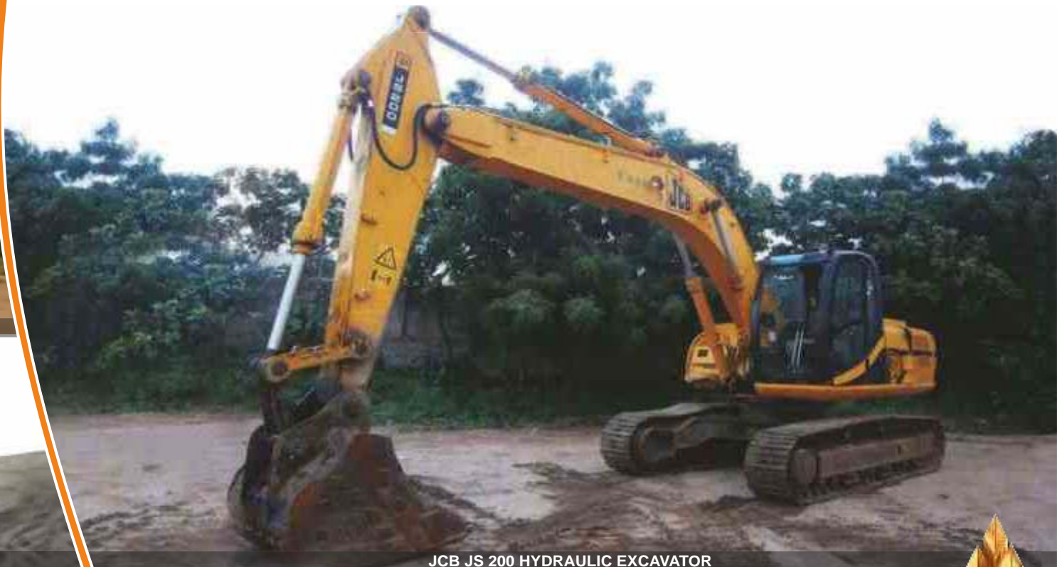
JCB JS 200 HYDRAULIC EXCAVATOR