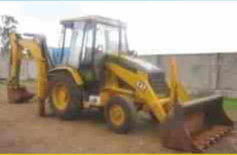
CAT 424 LOADER BACKHOE