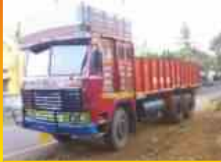
ASHOK LEYLAND TUSKER 2214 CARGO TRUCK