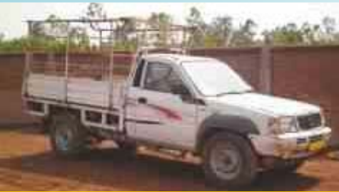
TATA 207 PICK UP