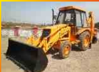
JCB 3DX LOADER BACKHOE