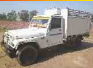
MAHINDRA MAXX PICK UP