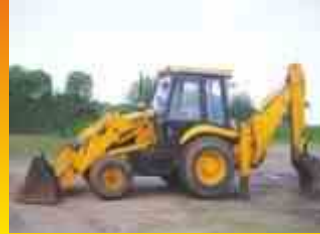
JCB 3DX LOADER BACKHOE