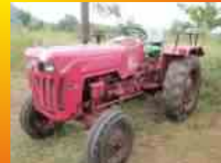
MAHINDRA 475 AGRICULTURE TRACTOR