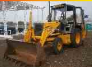
TATA JD 315 V LOADER BACKHOE