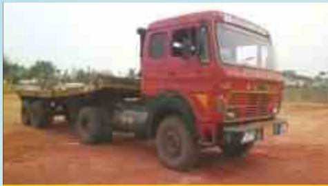
TATA LPS 3516 COMBINATION TRUCK