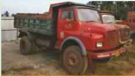
TATA SE 1613 TIPPER