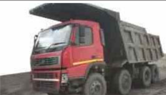
VOLVO FM 400 TIPPER