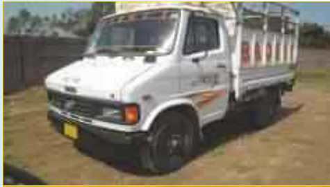
TATA SFC 407 CARGO TRUCK