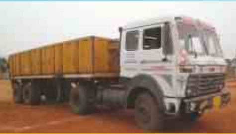
TATA LPS 3516 COMBINATION TRUCK