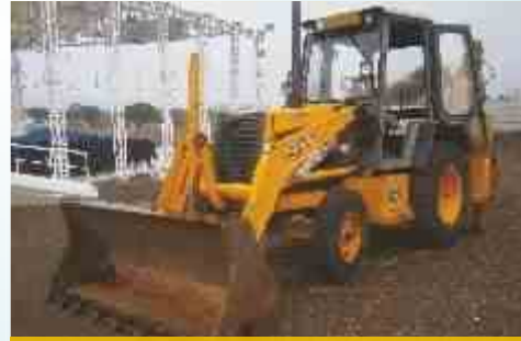
TATA JD 315 V LOADER BACKHOE