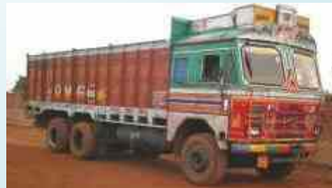
TATA LPT 2515 CARGO TRUCK