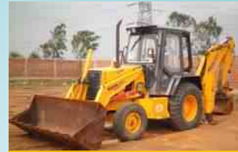
TATA JD 315 V LOADER BACKHOE