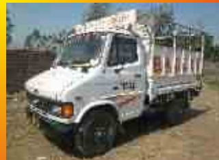
TATA 407 SFC CARGO TRUCK