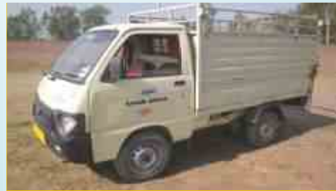
PIAGGIO APE PICK UP