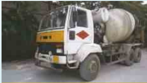
ASHOK LEYLAND 2516 CONCRETE MIXER TRUCK