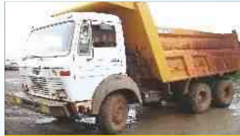
TATA 2516 TIPPER