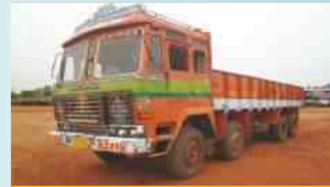
ASHOK LEYLAND 3116 CARGO TRUCK