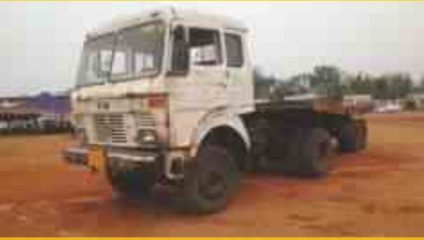
TATA LPS 3516 COMBINATION TRUCK