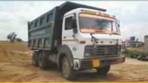
TATA 2516 TIPPER