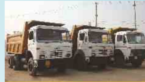
TATA 2516 TIPPERS