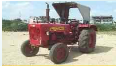
MAHINDRA 575 AGRICULTURE TRACTOR