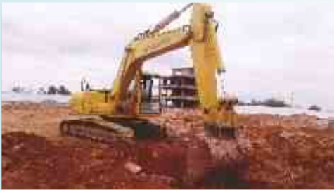
L&T KOMATSU PC 200 HYDRAULIC EXCAVATOR