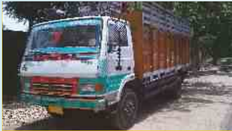
TATA LPT 709 CARGO TRUCK