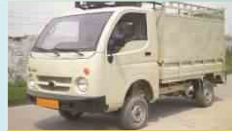
TATA ACE PICK UP