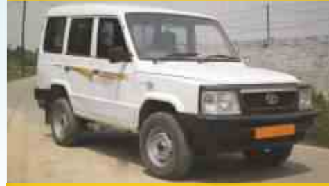
TATA SUMO MULTI UTILITY