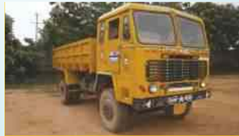
ASHOK LEYLAND COMET 1611 TIPPER