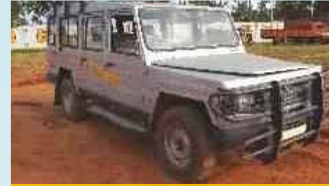
FORCE TOOFAN MULTI UTILITY