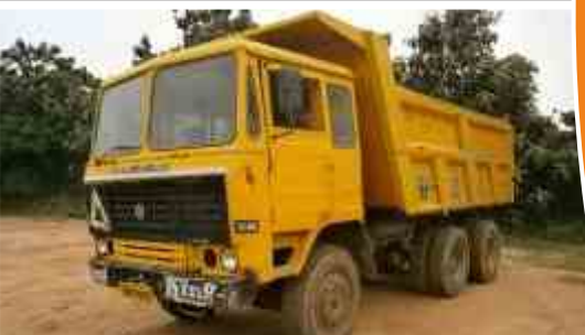
ASHOK LEYLAND 2516 TIPPER