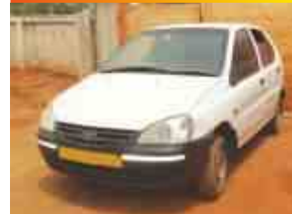
TATA INDICA AUTOMOBILE