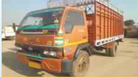
EICHER 11.10 CARGO TRUCK