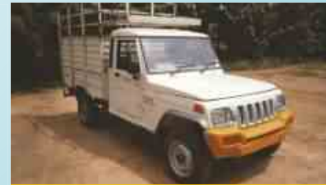
MAHINDRA BOLERO MAX PICK UP