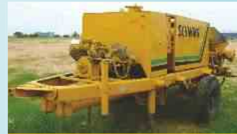
PORTABLE CONCRETE PUMP