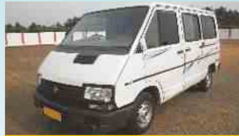
TATA WINGER MINI BUS