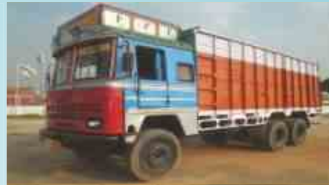
TATA LPT 2515 CARGO TRUCK