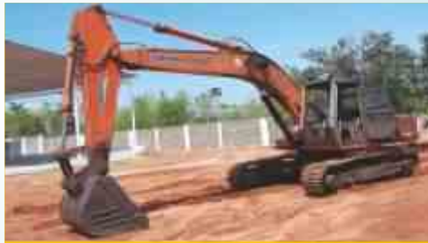
TATA HITACHI EX 200 HYDRAULIC EXCAVATOR