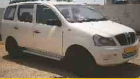
MAHINDRA XYLO MULTI UTILITY