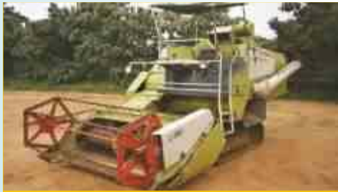
CLASS C 210 HARVESTOR