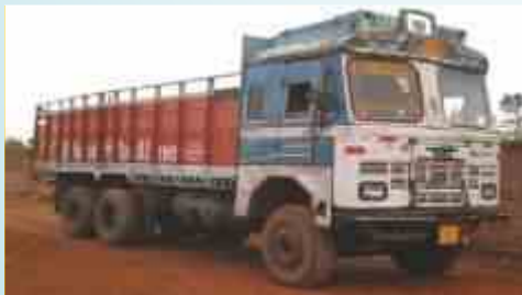
TATA LPT 2515 CARGO TRUCK