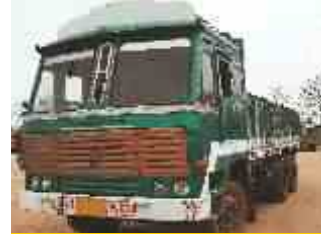
ASHOK LEYLAND TUSKER 2214 CARGO TRUCK