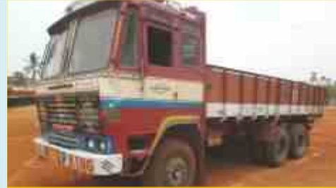
ASHOK LEYLAND TUSKER 2214 CARGO TRUCK