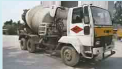
ASHOK LEYLAND 2516 CONCRETE MIXER TRUCK