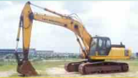
L&T KOMATSU PC 300 HYDRAULIC EXCAVATOR