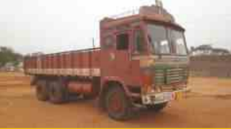
ASHOK LEYLAND TUSKER 2214 CARGO TRUCK