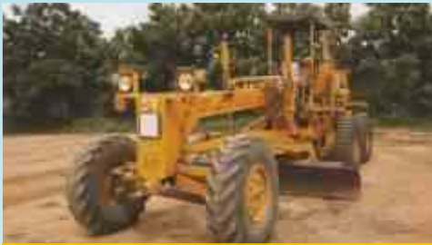
BEML BG 605 MOTOR GRADER