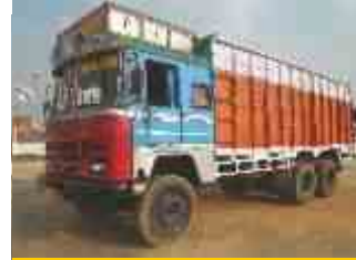
TATA LPT 2515 CARGO TRUCK