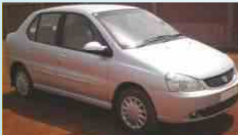
TATA INDIGO AUTOMOBILE