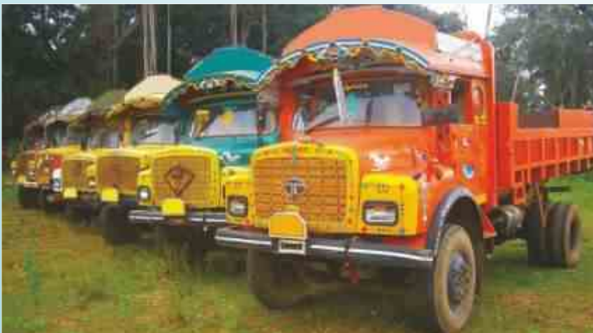
TATA SE 1613 TIPPERS