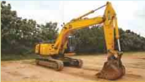
JCB JS 200 HYDRAULIC EXCAVATOR