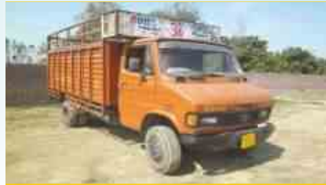
TATA SFC 709 CARGO TRUCK