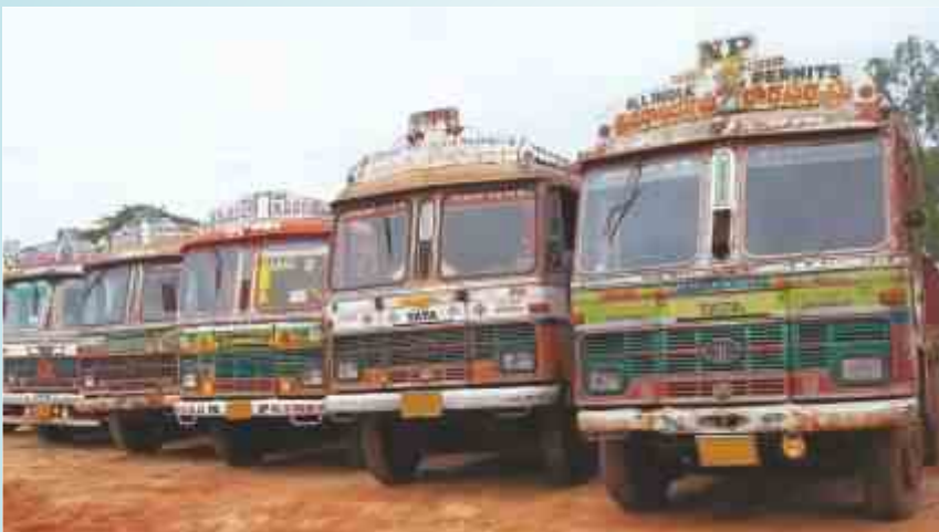
TATA LPT 2515 CARGO TRUCKS