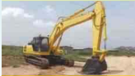
L&T KOMATSU PC 200 HYDRAULIC EXCAVATOR