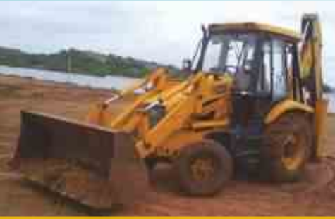
JCB 3DX LOADER BACKHOE