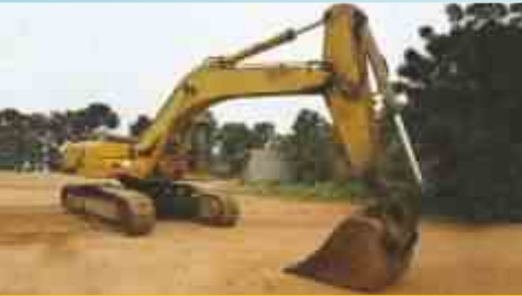
L&T KOMATSU PC 300 HYDRAULIC EXCAVATOR