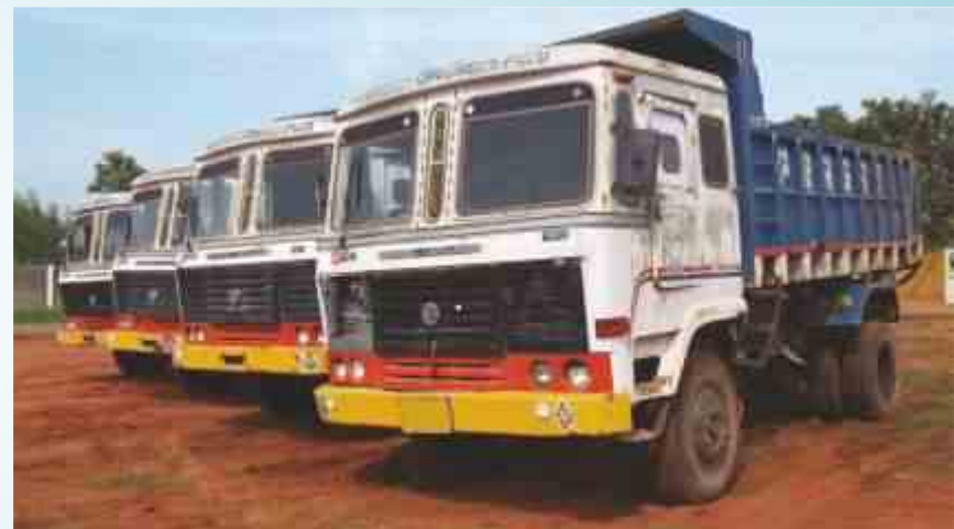
ASHOK LEYLAND 1613 TIPPERS