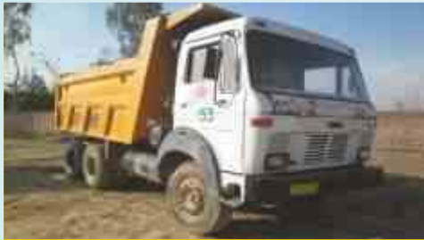
TATA 2516 TIPPER