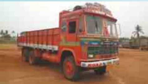
TATA LPT 2516 CARGO TRUCK