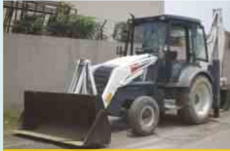
TEREX VECTRA TX 760 LOADER BACKHOE