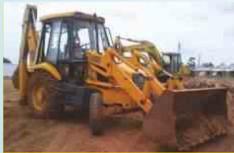
JCB 3DX LOADER BACKHOE