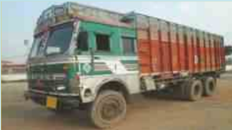
TATA LPT 2515 CARGO TRUCK