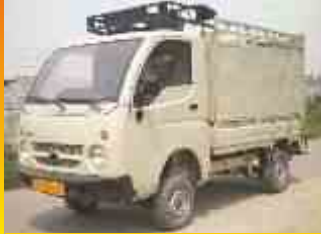
TATA ACE PICK UP