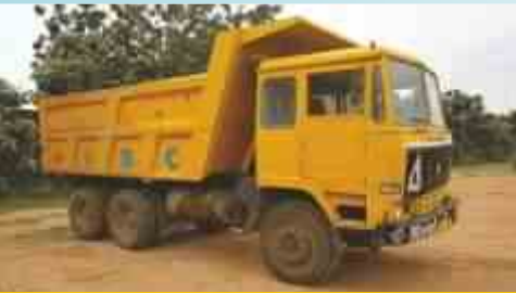
ASHOK LEYLAND 2516 TIPPER