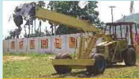
ESCORTS C8000 PICK & CARRY CRANE