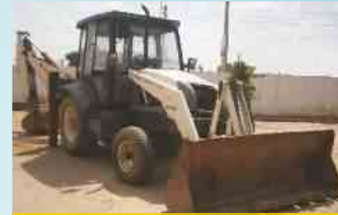
TEREX VECTRA TX 760 LOADER BACKHOE