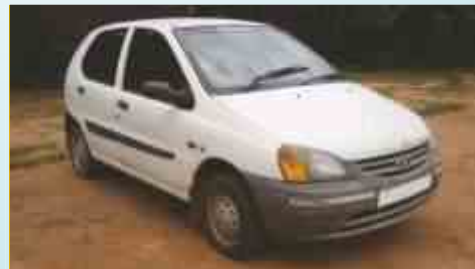
TATA INDICAB AUTOMOBILE