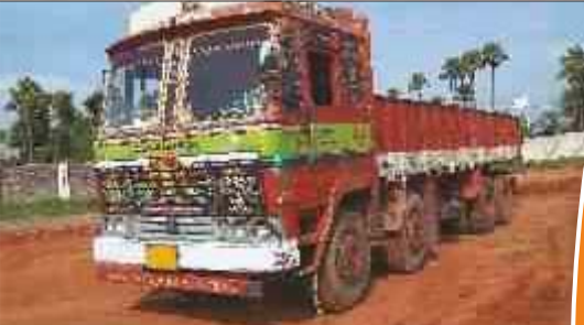
ASHOK LEYLAND 3116 CARGO TRUCK