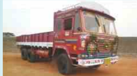
ASHOK LEYLAND TUSKER 2214 CARGO TRUCK