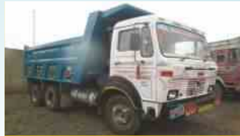
TATA 2516 TIPPER