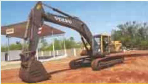
VOLVO EC 210 HYDRAULIC EXCAVATOR