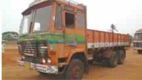
ASHOK LEYLAND TUSKER 2214 CARGO TRUCK