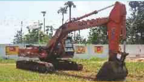
TATA HITACHI EX 200 HYDRAULIC EXCAVATOR