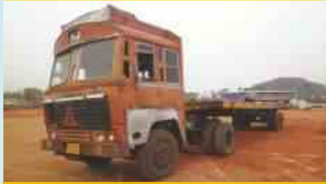
ASHOK LEYLAND 3516 COMBINATION TRUCK