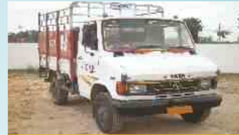
TATA SFC 407 CARGO TRUCK