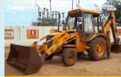
JCB 3D LOADER BACKHOE