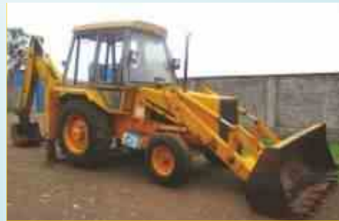
JCB 3D LOADER BACKHOE