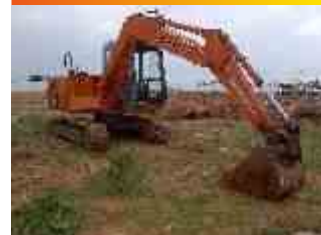
TATA HITACHI EX 200 HYDRAULIC EXCAVATOR