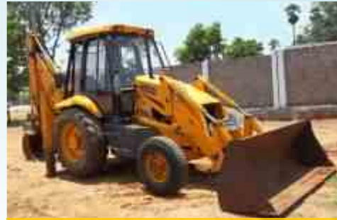
JCB 3DX LOADER BACKHOE