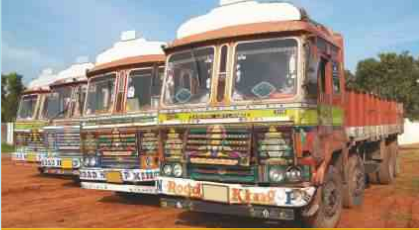
ASHOK LEYLAND 3116 CARGO TRUCKS

SHRIRAM AUTOMALL INDIA LIMITED (SAMIL) - HEAD OFFICE 709, Best Sky Tower, F-5, Netaji Subhash Place, Pitampura, Delhi-110034 Tel : 011.41414444, Fax : 011.42414444, Email : contact@samil.in , Website : www.samil.in Online Services : www.samil.in/bids Toll Free : 1800 102 4141