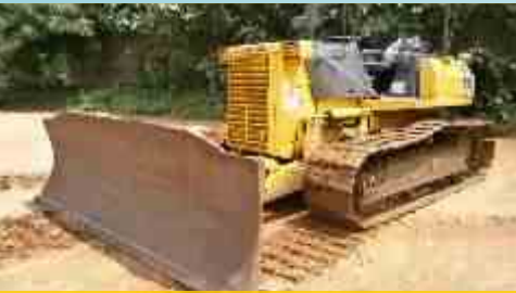
KOMATSU D41E CRAWLER TRACTOR