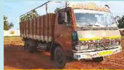
TATA LPT 909 CARGO TRUCK