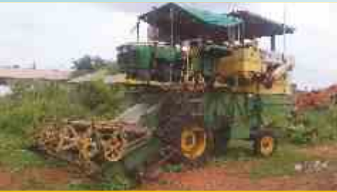
JOHN DEERE 5310 HARVESTOR