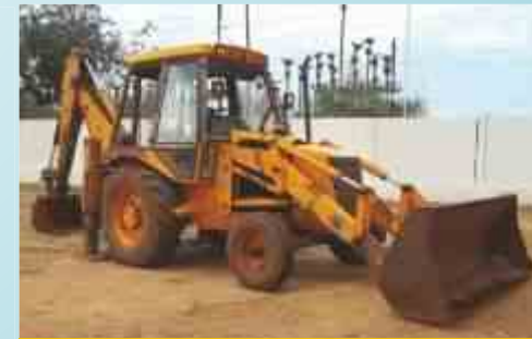
JCB 3D LOADER BACKHOE