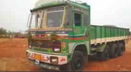
TATA LPT 3118 CARGO TRUCK

21 st - 22 nd November 2012, 10:00 a.m. onwards