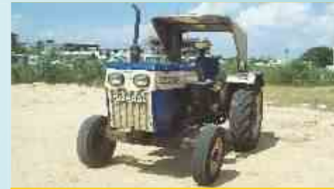
SWARAJ 735 AGRICULTURE TRACTOR