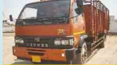
EICHER 11.10 CARGO TRUCK