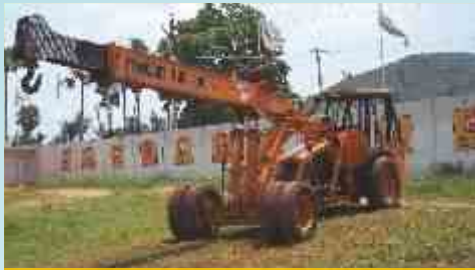
STANDARD HMC 9000 PICK & CARRY CRANE