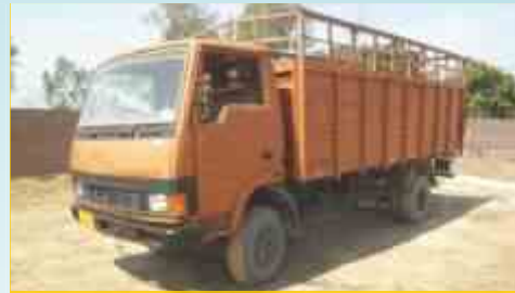
TATA LPT 909 CARGO TRUCK