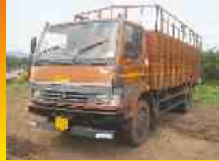
TATA LPT 1109 CARGO TRUCK