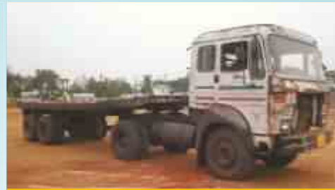
TATA LPS 3516 COMBINATION TRUCK