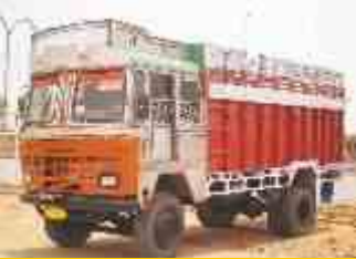
TATA LPT 1613 CARGO TRUCK