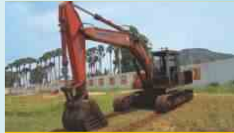
TATA HITACHI EX 200 HYDRAULIC EXCAVATOR