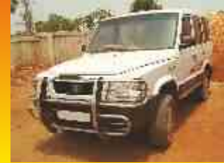
TATA SUMO MULTI UTILITY