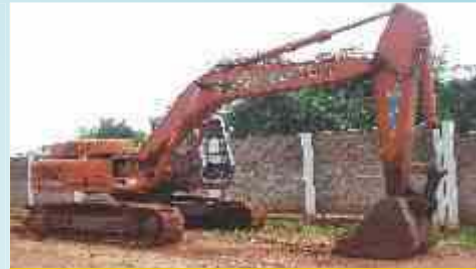
TATA HITACHI EX 200 HYDRAULIC EXCAVATOR