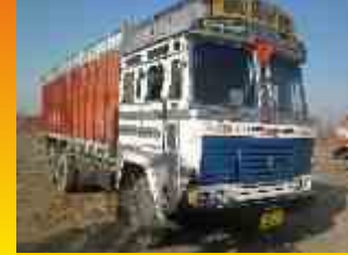
ASHOK LEYLAND TUSKER 2214 CARGO TRUCK