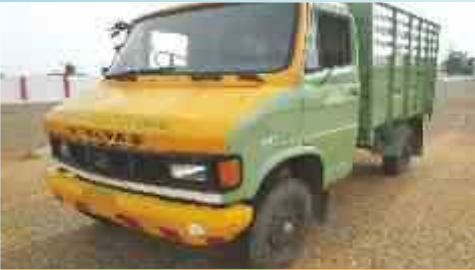
TATA SFC 407 CARGO TRUCK