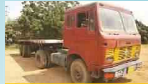
TATA LPS 3516 COMBINATION TRUCK