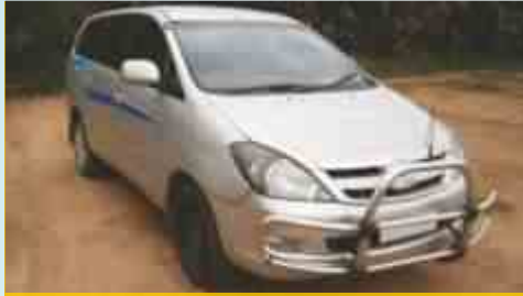
TOYOTA INNOVA MULTI UTILITY