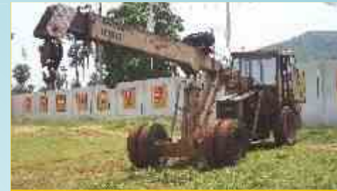
ESCORTS C8000 PICK & CARRY CRANE