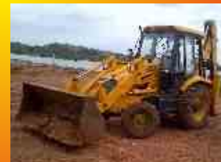
JCB 3DX LOADER BACKHOE