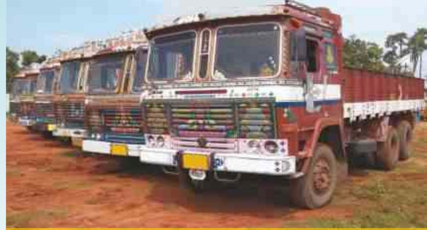
ASHOK LEYLAND 2214 CARGO TRUCKS