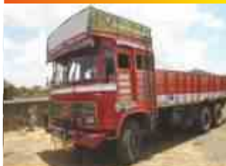
TATA LPT 2515 CARGO TRUCK