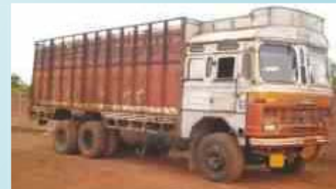
TATA LPT 2515 CARGO TRUCK