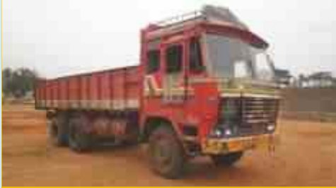
ASHOK LEYLAND TUSKER 2214 CARGO TRUCK