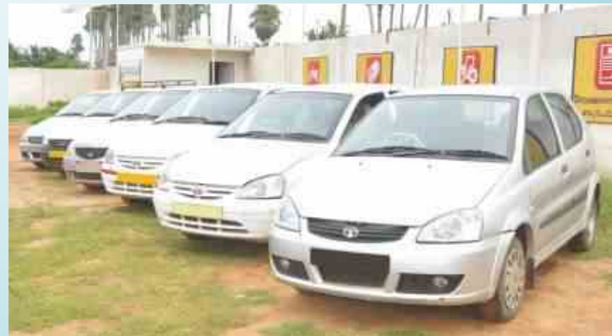
TATA INDICA AUTOMOBILES