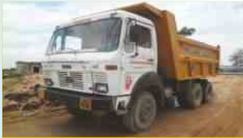
TATA 2516 TIPPER