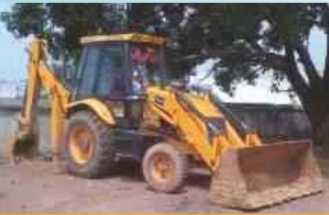
JCB 3DX LOADER BACKHOE