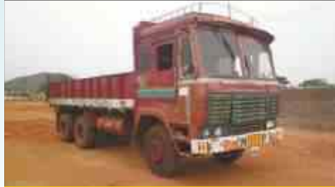
ASHOK LEYLAND TUSKER 2214 CARGO TRUCK