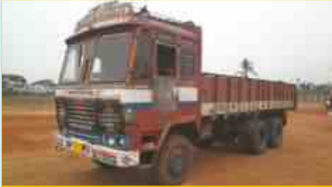
ASHOK LEYLAND TUSKER 2214 CARGO TRUCK