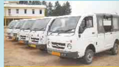
TATA MAGIC MINI BUSES