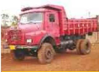
TATA SE 1613 TIPPER