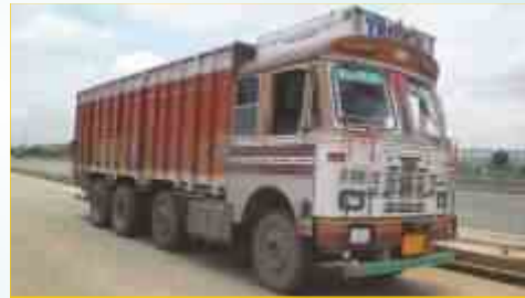
TATA LPT 3118 CARGO TRUCK