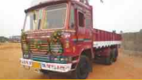
ASHOK LEYLAND TUSKER 2214 CARGO TRUCK