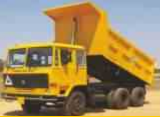
ASHOK LEYLAND 2516 TIPPER