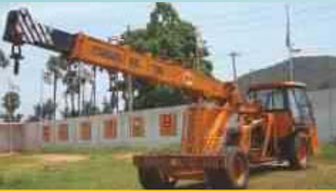
STANDARD HMC 9000 PICK & CARRY CRANE